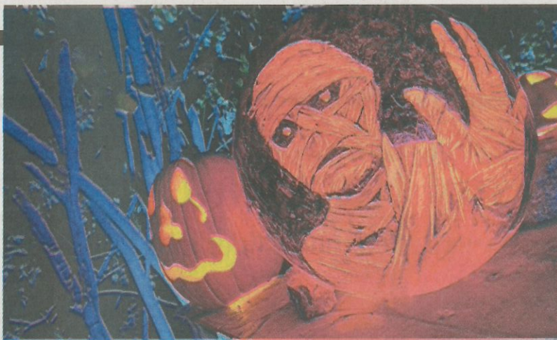
BILL GALLERY/GO PROVIDENCE

Bring your appetite and curiosity to the third annual ATK Boston EATS, a three-day cooking, food, and wine festival celebrating the region's best chefs, bartenders, and restaurants presented by America's Test Kitchen (Oct. 24-26). Saturday's main event will feature all-you-can-eat food and craft cocktails from more than 30 of the region's top dining destinations including Blue Ribbon BBQ, El Pelon Taqueria, La Morra, Pabu, Shojo, and the Gallows, as well as live cooking demos by culinary stars, their own TV hosts